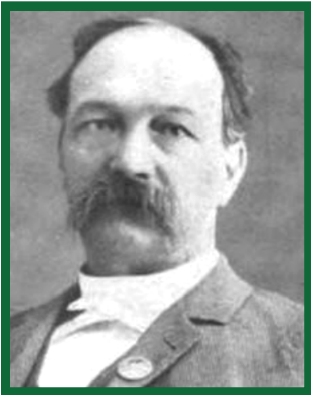
EDGAR ENOCH HUME 1875 – 1877 State Representative